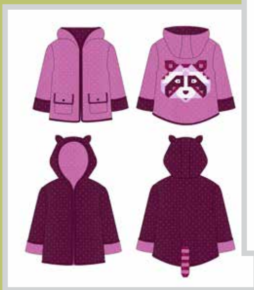
BCQ 006 Little Raccoon Coat Sizes 1-5 yrs and 6-10 yrs