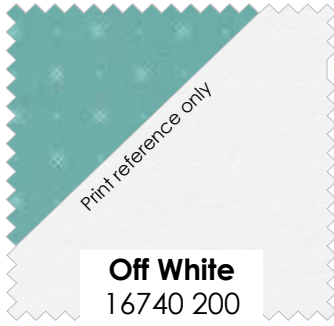
Off White 16740 200