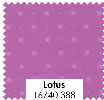
Lotus 16740 388