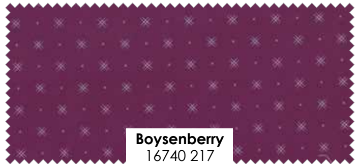
Boysenberry 16740 217