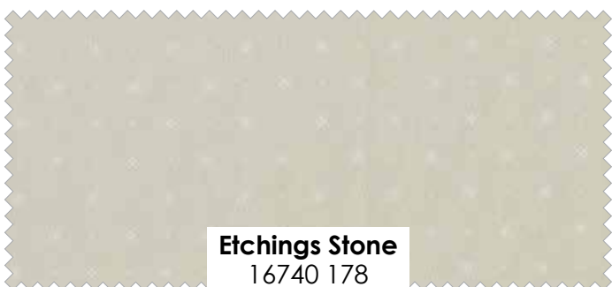
Etchings Stone 16740 178