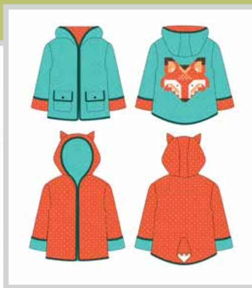
BCQ 004 Little Fox Coat Sizes 1-5 yrs and 6-10 yrs