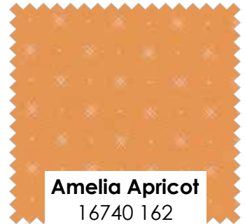
Amelia Apricot 16740 162