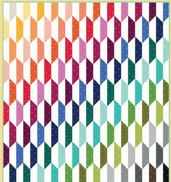
BCQ 008 Hive 48" x 52"