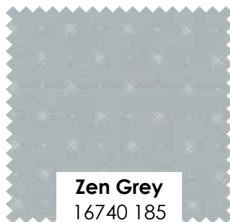
Zen Grey 16740 185