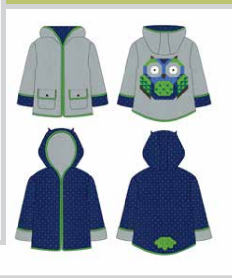
BCQ 005 Little Owl Coat Sizes 1-5 yrs and 6-10 yrs