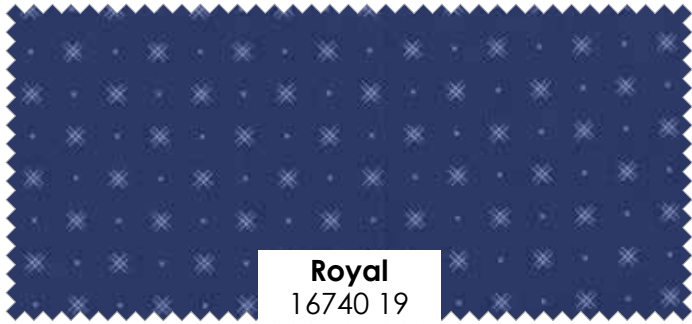
Royal 16740 19