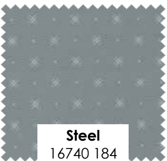
Steel 16740 184