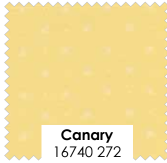
Canary 16740 272