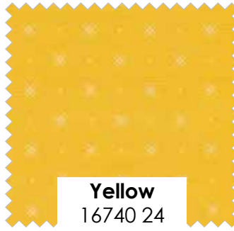
Yellow 16740 24