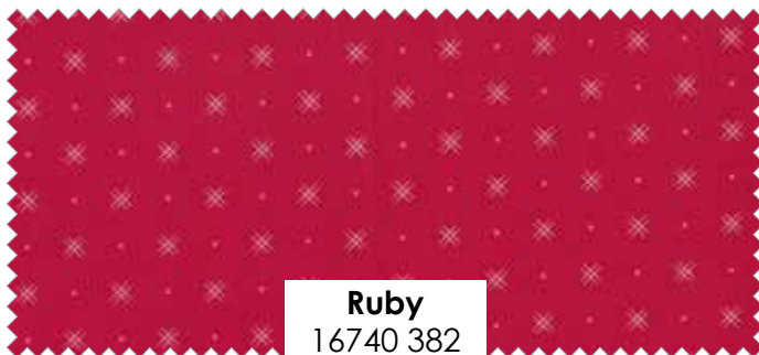
Ruby 16740 382