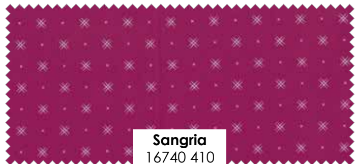
Sangria 16740 410