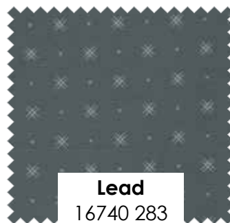
Lead 16740 283