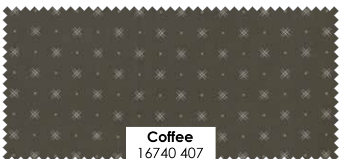
Coffee 16740 407