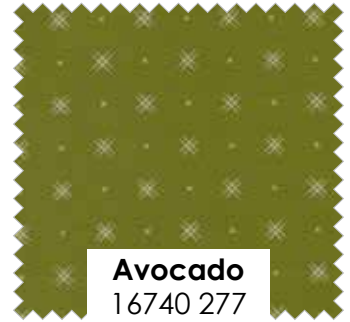
Avocado 16740 277