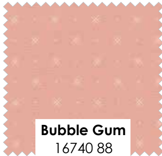
Bubble Gum 16740 88