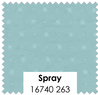
Spray 16740 263