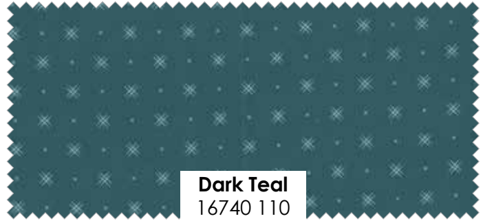
Dark Teal 16740 110