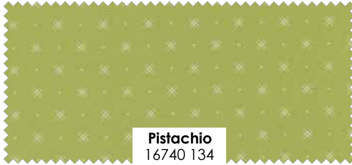
Pistachio 16740 134