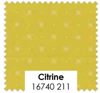
Citrine 16740 211