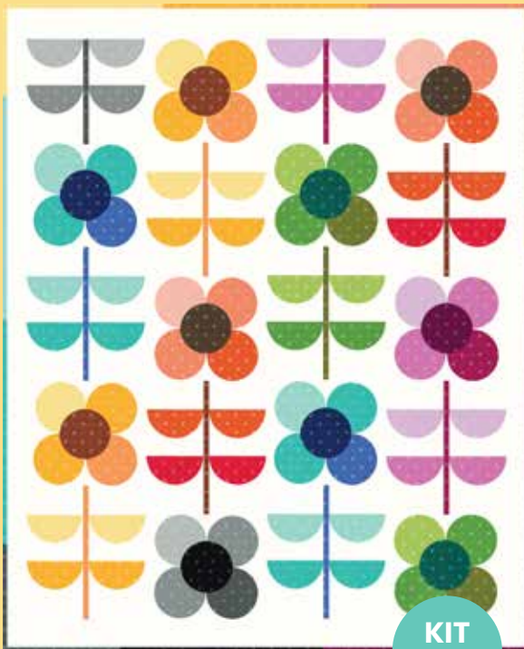
BCQ 007 Utopia 50" x 61"

Putting a simple, structured white print that Annie has titled *On Point*, onto thirty colors of Bella Solids, this rainbow palette can be used to create modern stand-alone projects, or they can be mixed with existing solids for an extra pop. To make color-matching a breeze, the numbers of Beyond Basics are the same as the corresponding Bella Solid.