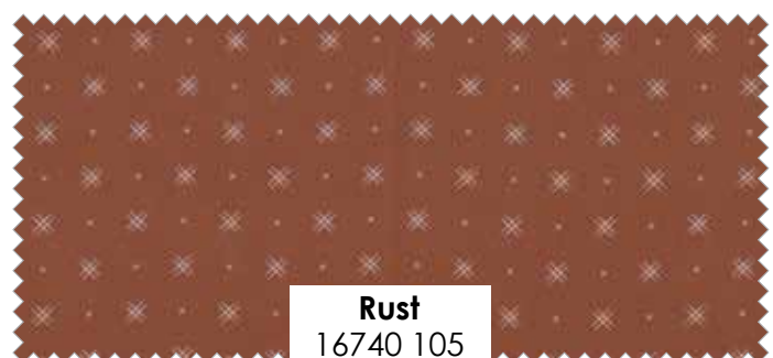
Rust 16740 105