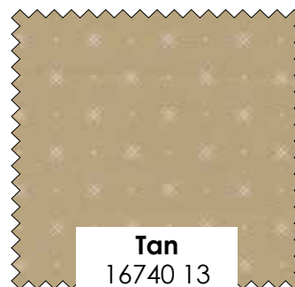
Tan 16740 13