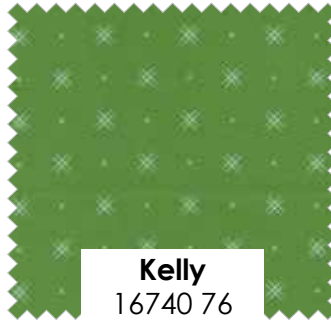
Kelly 16740 76