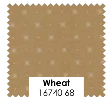
Wheat 16740 68