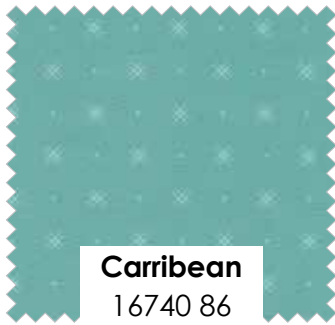
Carribean 16740 86