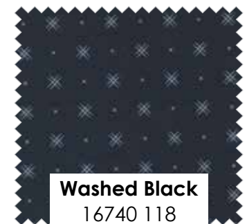
Washed Black 16740 118