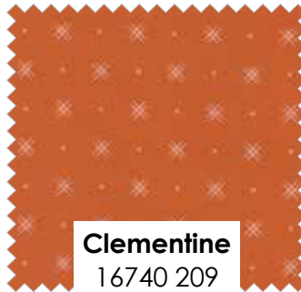
Clementine 16740 209