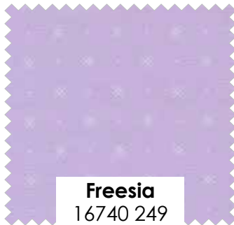
Freesia 16740 249