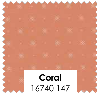
Coral 16740 147