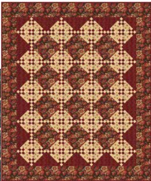
BCD 1303 Nantucket Red 63" x 76"