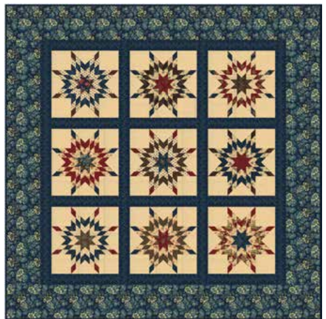
BCD 1301 Blazing Stars 84" x 84" FQ Friendly