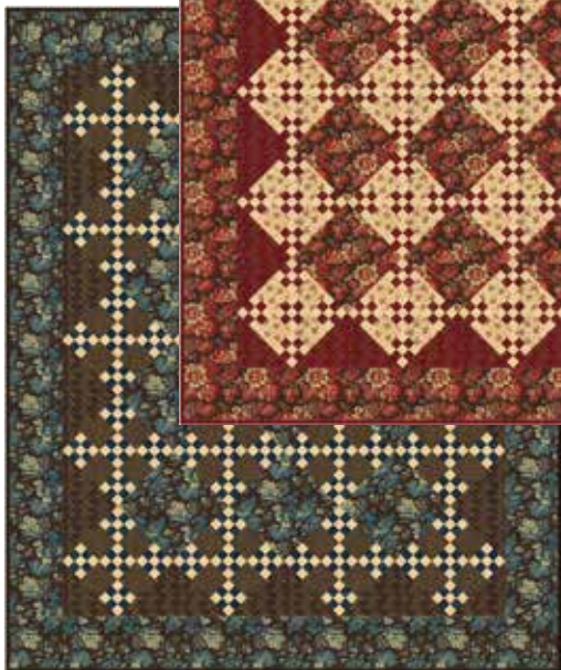
BCD 1303 Nantucket Blue 63" x 76"