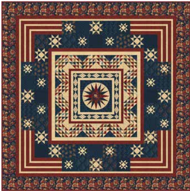
BCD 1302 Miss Mitchell Dark 82" x 82" PP Friendly