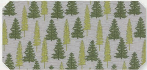
Woodland Trees - 19917 12 * / B*