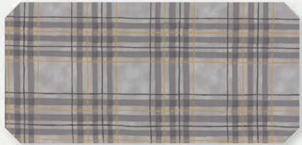
Plaid - 19913 12 * / B*