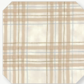
Plaid - 19913 11/ B