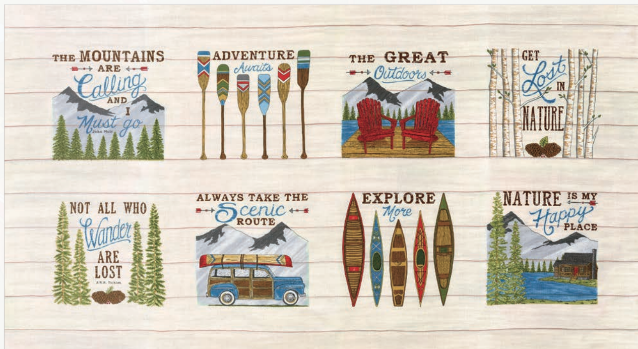
19910 11 * / B* - Panel measures 24" x 44". Each block measures approx. 8" x 8"