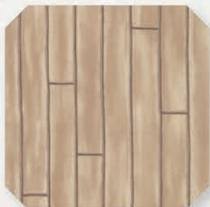
Wood Slats - 19918 12 * / B*