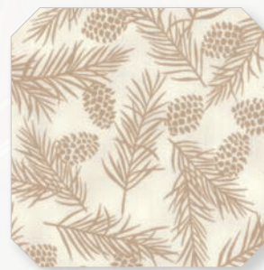
Pine Tree Monotone - 19915 11 / B