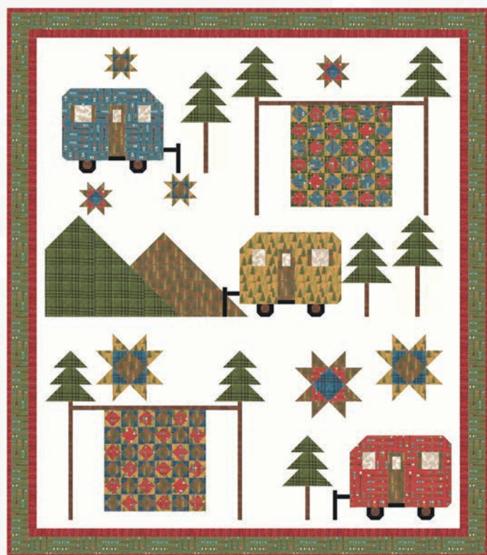
CHD 1913 / CHD 1913G GO RVING - 56" x 64"