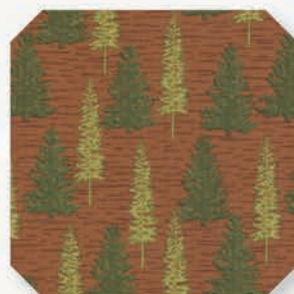
Woodland Trees - 19917 16 / B