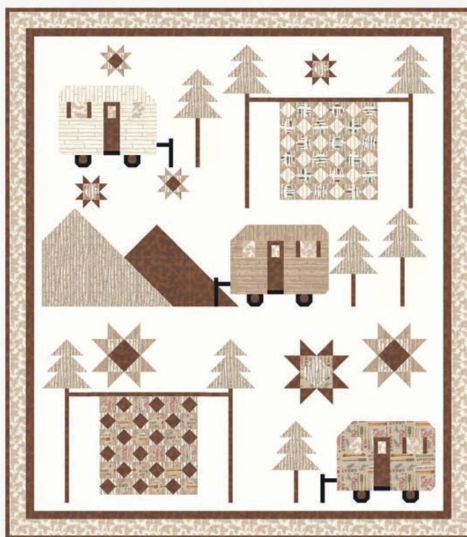
CHD 1913 / CHD 1913G GO RVING EARTH TONES - 56" x 64"