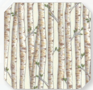
Birch Trees - 19916 11 * / B*