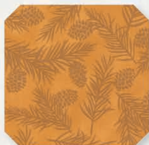
Pine Tree Monotone - 19915 17 * / B*