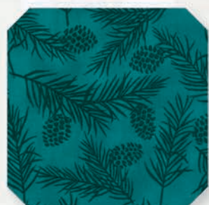
Pine Tree Monotone - 19915 14 / B