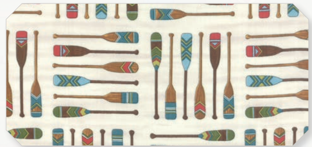
Oars - 19912 11 * / B*