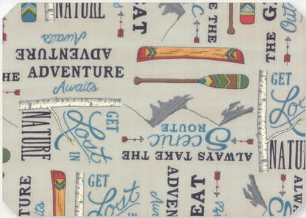
The Great Outdoors - 19911 13 * / B*