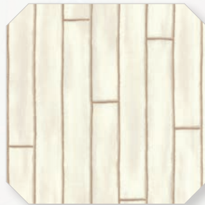
Wood Slats - 19918 11 / B