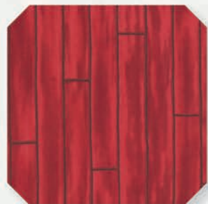
Wood Slats - 19918 15 / B