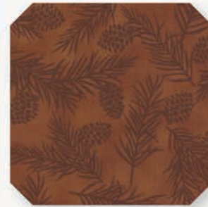
Pine Tree Monotone - 19915 18 / B