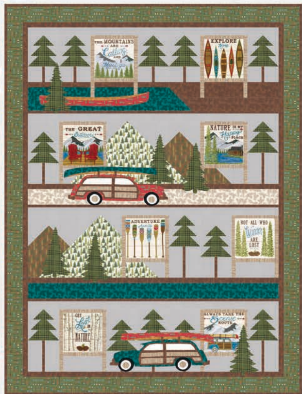
CHD 1912 / CHD 1912G BILLBOARDS - 56" x 74"