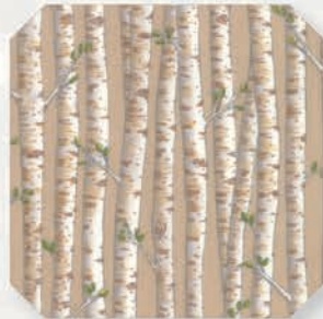
Birch Trees - 19916 12 / B