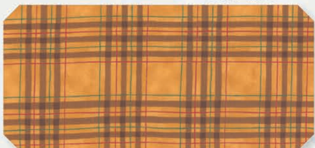
Plaid - 19913 16 * / B*