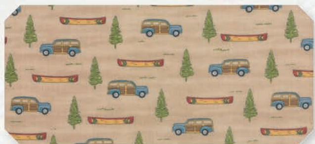
Adventure Awaits - 19914 12 * / B*