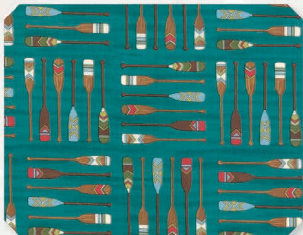
Oars - 19912 12 * / B*