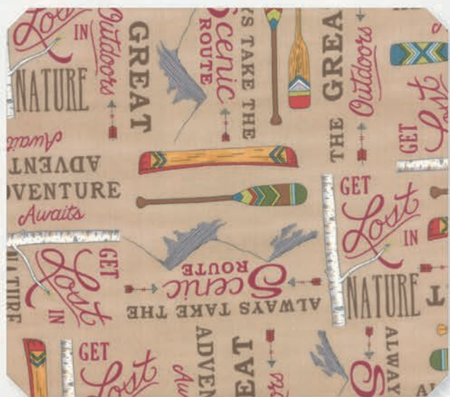
The Great Outdoors - 19911 12 * / B*