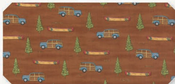
Oars - 19914 15 * / B*

ALL PRINTS ARE AVAILABLE IN PLAIN & BRUSHED. "B" INDICATES BRUSHED.