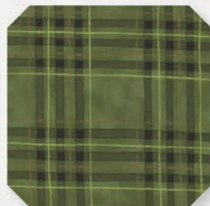
Plaid - 19913 15 / B