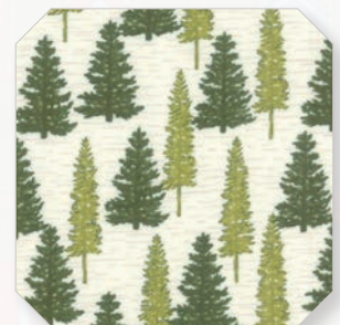
Woodland Trees - 19917 11 / B