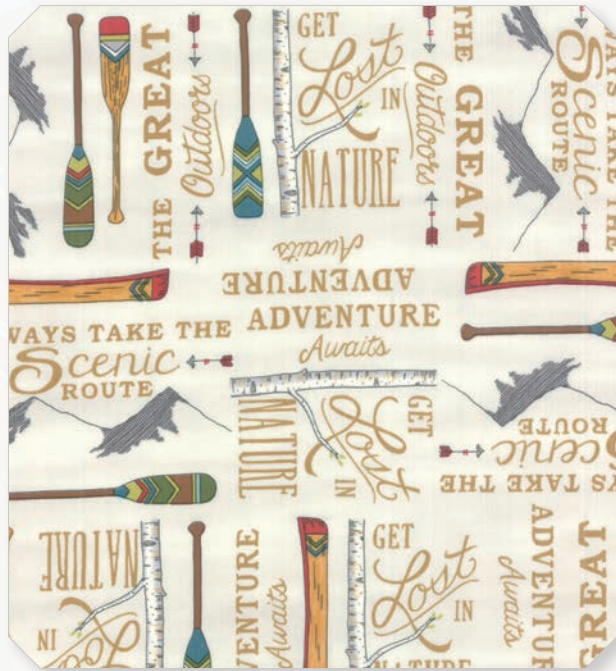
The Great Outdoors - 19911 11 * / B*