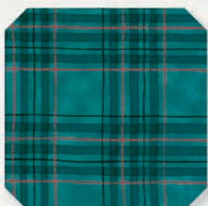
Plaid - 19913 13 / B