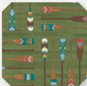
Oars - 19912 14 / B