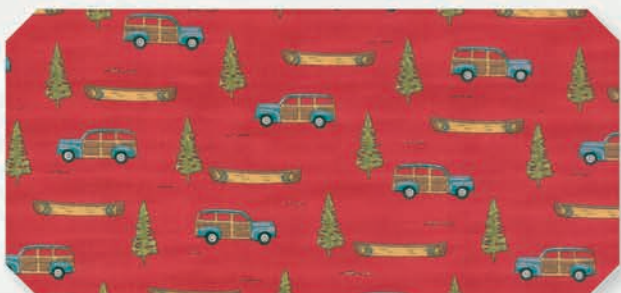
Adventure Awaits - 19914 14 * / B*