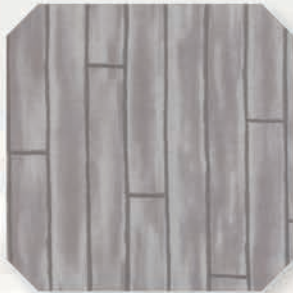
Wood Slats - 19918 13 / B