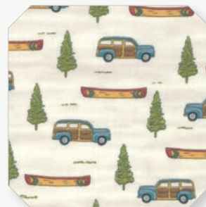
Adventure Awaits - 19914 11 / B