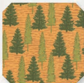
Woodland Trees - 19917 15 / B