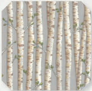
Birch Trees - 19916 13 * / B*