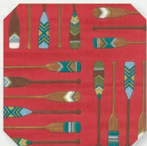
Oars - 19912 13 / B